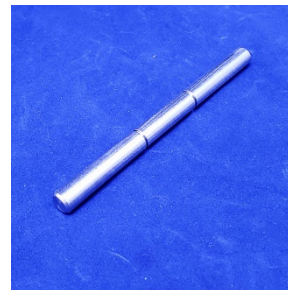
2202626 Latch Pin