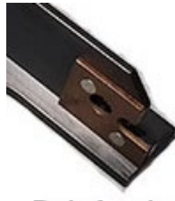
Close-up of Tab

To accommodate the reinforcing tabs, the E-rings that secure the latch pin must be at the center of the steering housing. Latch pin 2202626 has properly located E-ring slots. If the original steering housing is functional only replace the latch pin. If the steering housing must be replaced, 2997029 is a steering housing with the correct latch pin.