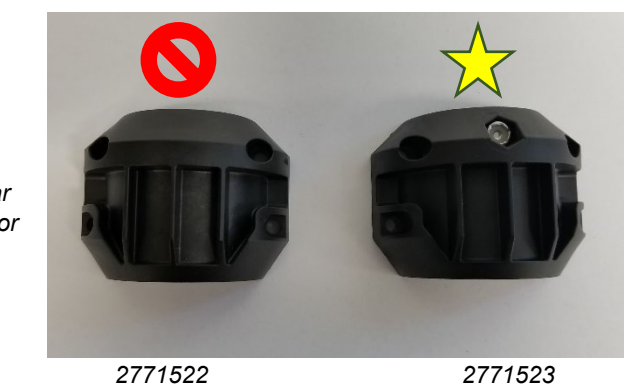
Back Collar Half, Exterior

It is not necessary to replace collars on motors where the collar has not failed.